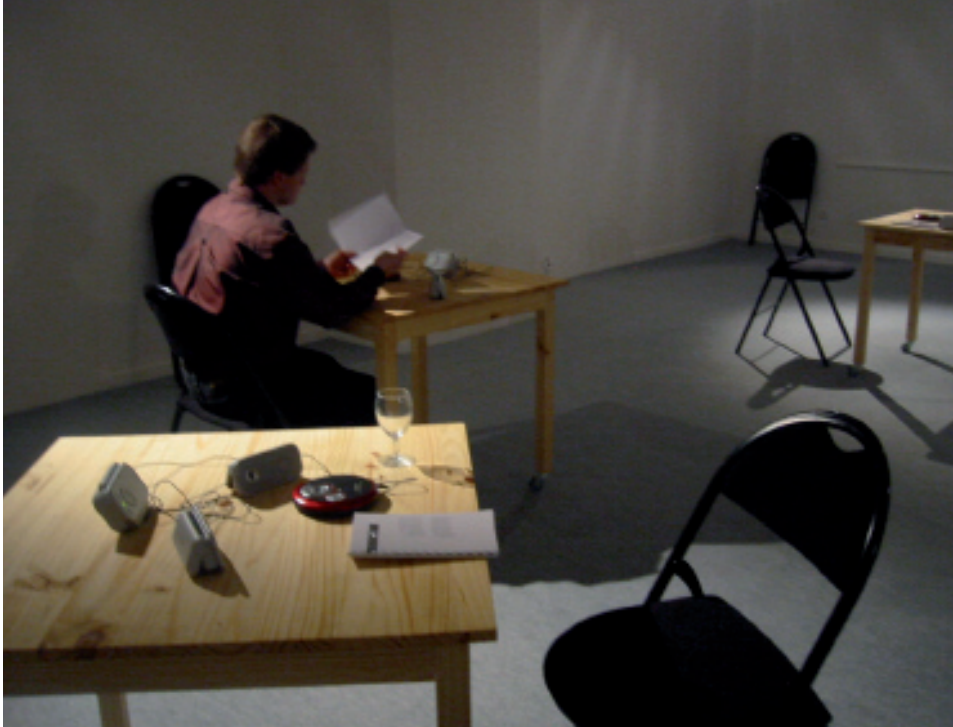
Radio Revolten , Halle (September 2006)

Locating the radio memory library in a local cafe in the city of Halle in Germany, which functions as a social space for the Radio Revolten festival.